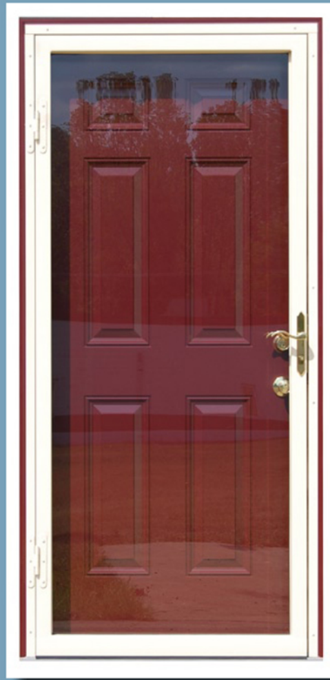
SD100 FULL VIEW

All ULTRAVIEW doors receive a twelve stage wash before being E-coated and are finish coated with "Green Technology" Polyester Powder Coating.