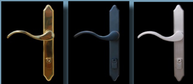
Bright Brass (Standard)